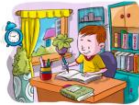
To do your work on time