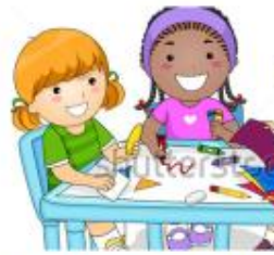
Keep track of your belongings... pencils, colours, erasers...