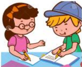
Check your work