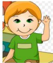
To ask questions when you have a doubt.

Here, some responsible choices are given and write down below that you like to choose.